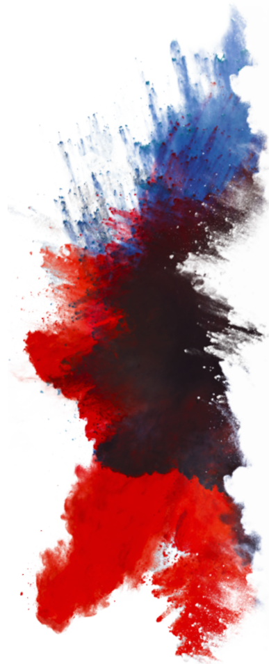
conception graphique : Baptiste CHARLES